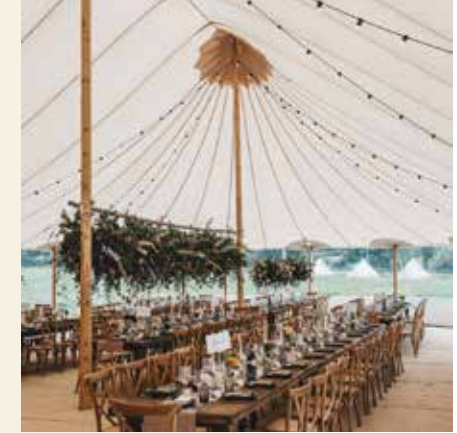
Long Farmhouse Tables