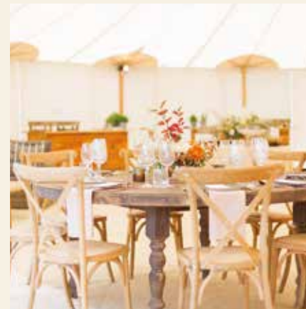
Round Farmhouse Tables