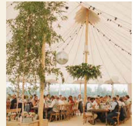
1.2m Floral Hoop