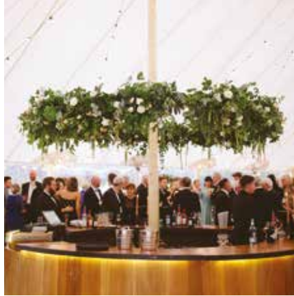
3m Floral Hoop