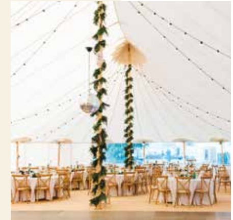
Sperry Mirror Ball