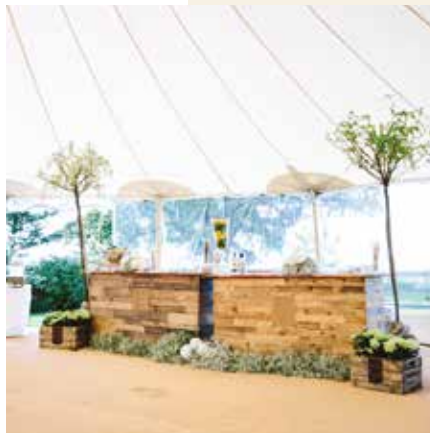
Reclaimed Oak Bar