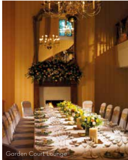
Garden Court Lounge