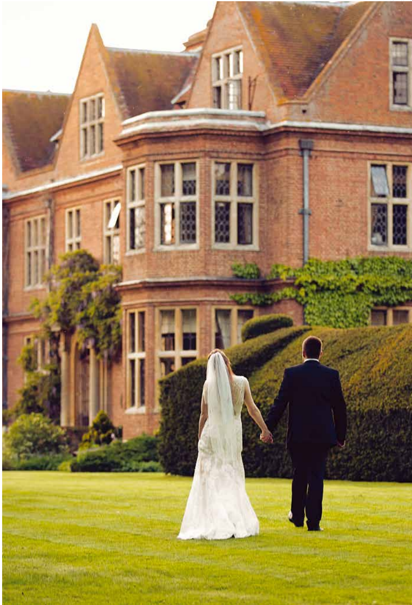
DE VERE HORWOOD ESTATE

“” When I saw you I fell in love, and you smiled because you knew.